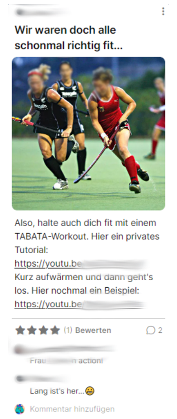
Figure 4 Post with picture of female athletes that breaks with stereotypical conventions of visual representation (CP 1) [Title: "Once we all were really fit...". Text: "So, stay fit with a TABATA workout. Find a private tutorial here: anonymous weblink. Quick warmup and then let's go. Here another example: anonymous weblink". Comments: "Mrs. Anonymous in action!", "It's been a long time...].

However, there are also posts that break with stereotypical gender relations. For example, the female field hockey player in Figure 4 is not presented as passive, modest, good looking and joyful, which would be the traditional form of representing female athletes in mainstream media, but rather as actively involved in contact with an opponent with an intense, fighting facial expression, i.e., according to conventions of representing male athletes (Hartmann-Tews & Rulofs, 2003).